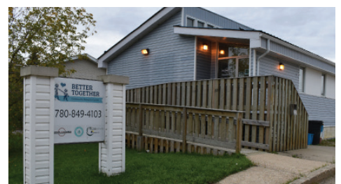
Parentlink Schedule Page 9