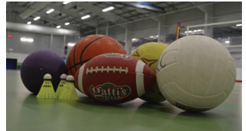
Multi-Rec Centre Schedule Page 2 to Page 7

Be sure to take advantage of all the great drop in swims at the Northern Lights Aquatic Centre! See Page 10 for details