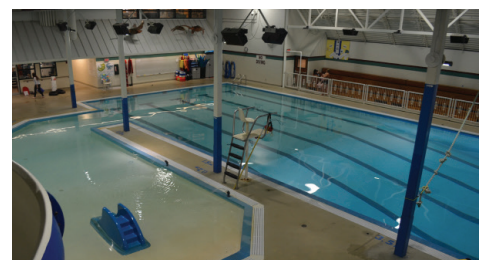
Northern Lights Aquatic Centre Page 10