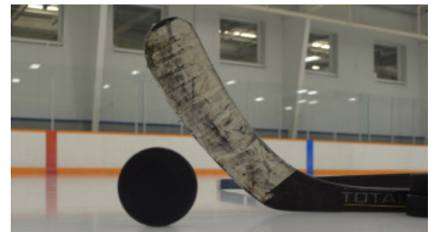
Arena Schedule Page 2 to Page 7